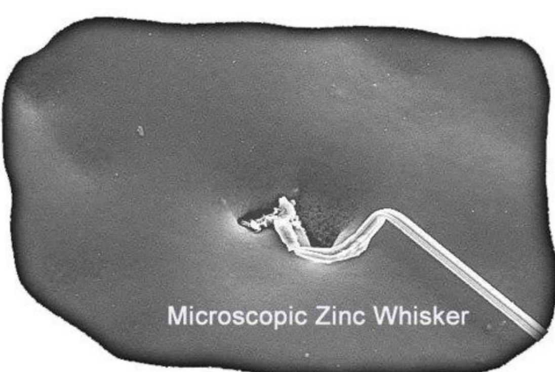
Microscopic Zinc Whisker